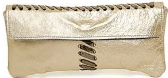
Mari Lassa Marie Small Platinum Clutch, Cost: $120

Mari Lassa Justine Midnight Blue Shoulder, Cost: $295